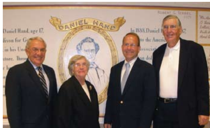
Their dream became a reality to fund future teachers.